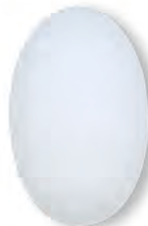
Firm Testicular Prosthesis