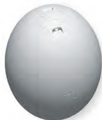
Saline Filled Testicular Prosthesis

Testi10™ is designed with high quality silicone. The prosthesis is shaped and designed with a soft texture to offer patients missing one or both testicles a more natural like feeling.