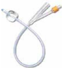
Indwelling Urinary Catheters